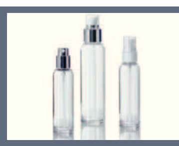
Rebhan's elegant bottle line is made of unbreakable glass polymer