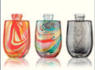
Gerresheimer's new marble-effect surface finish