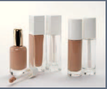
Baralan's applicator has a curved shape and rounded tip