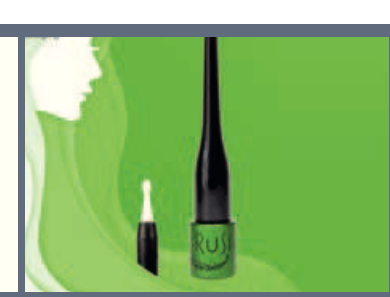
Rusi's Bubble Tip Eyeliner allows a precise lid line in just one application