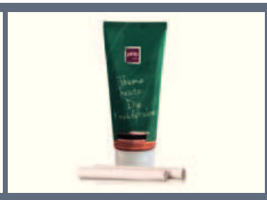
irlo's tube is made of chalk and PE