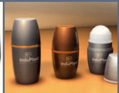
InduPlast's roll-on line made

KHK's formula for Planty is the company's standard for lip-care sticks. Oils and waxes of natural origin, such as beeswax and shea butter, together with vitamin E, protect the lips. The formula has now been developed into a colourless lip-care product without vanilla scent especially for men. An extract of hops softens raw male lips. If desired, the formula can also be NaTrue-certified and supplied as a vegan product. www.lipcare.de