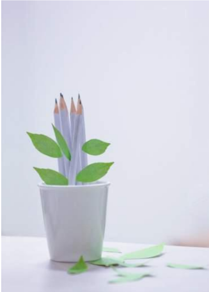
Appree design - Korea