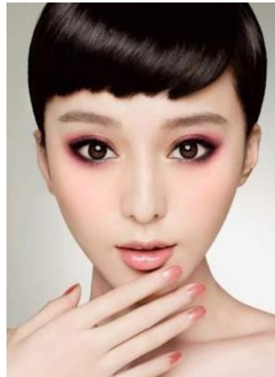
Fan Bing Bing – CHINA