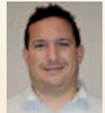
Stephen Weinberg