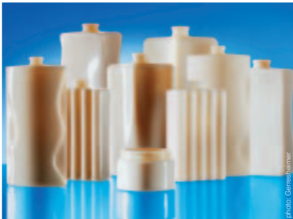
Bottles and jars with an ivory glow

T1 is Rexam Airspray's new foamer pump which is currently being used on the Colgate Palmolive foaming hand-wash for kids. The product, in a container decorated with penguins, is called " Splish Splash Splosh ", and is scented with a berry cher-