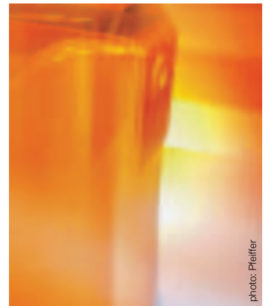
Customised dispensing system

The new ModulArt from Pfeiffer is a monobloc packaging concept that can be easily adapted to the client's wishes. It includes a pump, outer shell and actuator assembled from standard components whereby only the outer shell or housing has to be changed to achieve product differentiation and offer client-specific design solutions at a fraction of the usual development cost. The shape, decoration and colour of the shell can all be adapted as required.