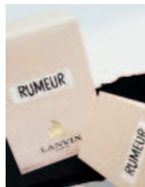
Imitation newspaper print in reverse embossing

The fascinating foil-clad carton for "Noa Perle", the new women's fragrance from Cacharel has a green and violet interplay of colours on the sides of the box producing an optical illusion that appears to project an iridescent pearl onto the carton. To achieve this vibrant pearlescent gloss La Spic applied, in perfect register, a hologram foil to the carton that mirrors in three dimensions the spherical shape of the flacon inside.