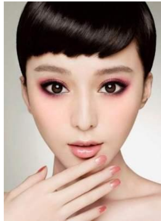
Fan Bing Bing – CHINA