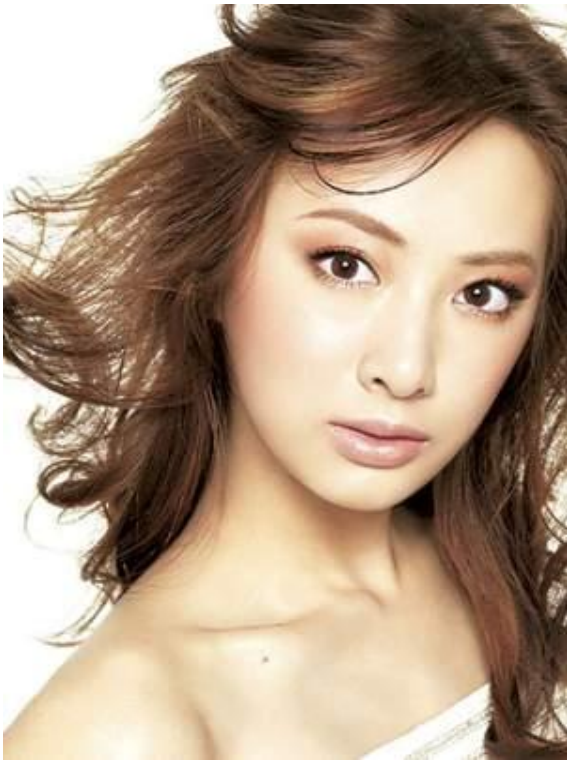
Keiko Kitagawa – JAPAN

Without forgetting that each country features it's sense of ideal beauty enhancing many subtle differences from face shape to skin tone